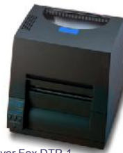
Silver Fox DTP-1